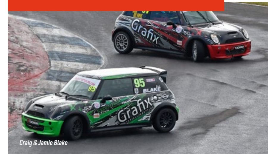
Craig & Jamie Blake

This is the fastest single make saloon car class at this Scottish Championship race meeting. Full slick and wet tyre options are permitted, a 1.6 litre super charged power unit, and three way adjustable suspension. This provides drivers with an exciting saloon car. They race with the Cooper cars.