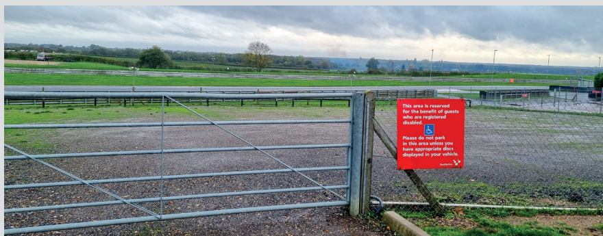
Hard surface parking located at Murrays

In both cases you will be permitted to park infield, rather than on the main outfield car parks. You will be directed to blue badge parking by event stewards.