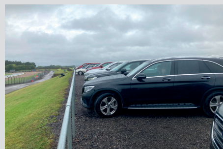
Hard surface parking at Coppice

Please note: For smaller events ALL parking is accessible through the main entrance only with parking in dedicated bays. Please check the ticket page for details.