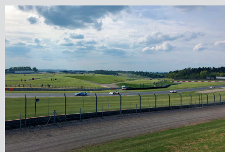
Trackside view at Coppice

Please see map on reverse for entry and parking locations.