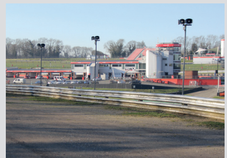
Southbank parking area

Please see map on reverse for entry and parking locations.