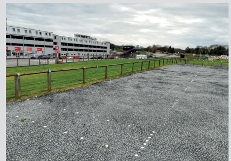
Hard surface parking within venue

Please note: At Grade D (smaller, club-level) events ALL parking is accessible through the main entrance (only). For a list of Grade D events visit www.msv.com .